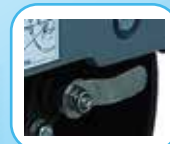
HEAVY DUTY PARKING BRAKE