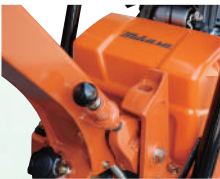
Self locking system