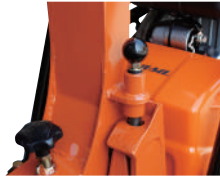
Variable speed adjustable