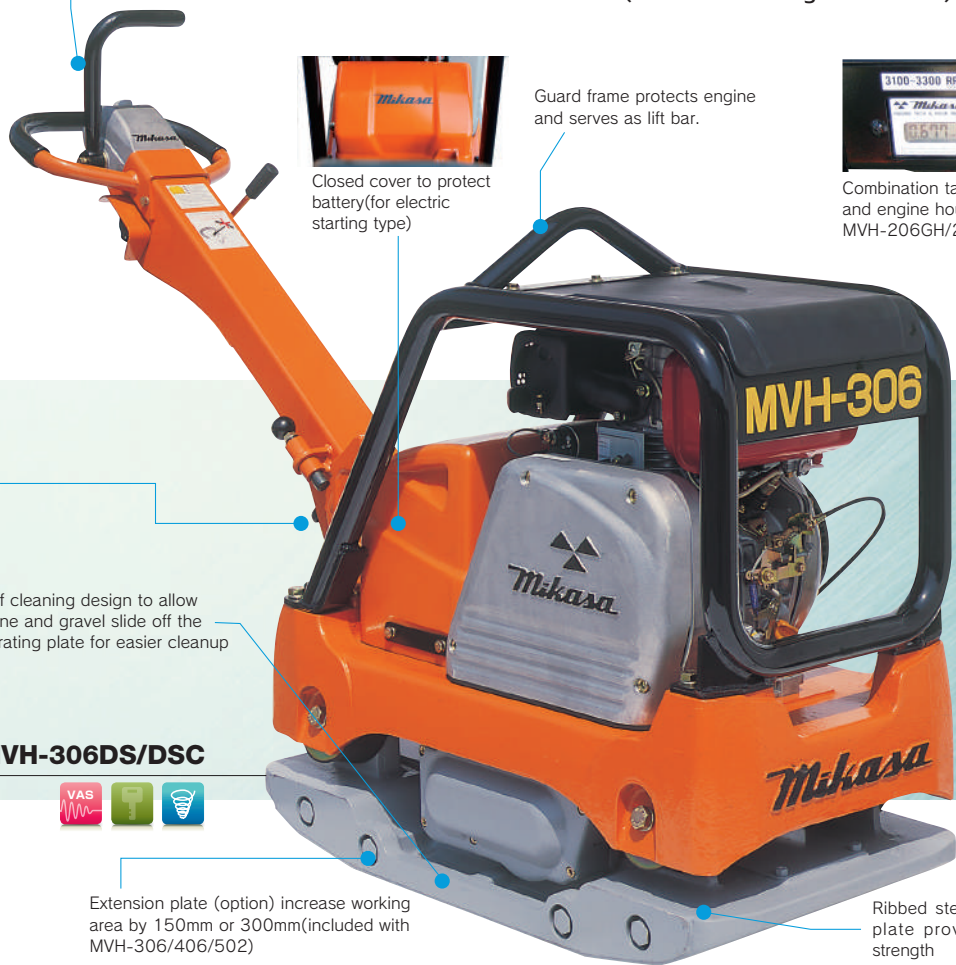
Guard frame protects engine and serves as lift bar.