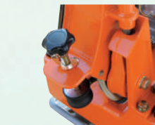
Adjustable handle height