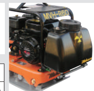
MVH-R60 Water tank (8.5 ℓ)