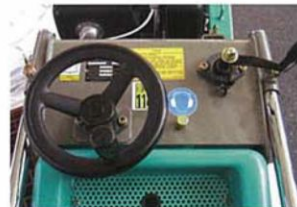
semi self propelling