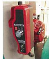
electric start (for MCD-218CEH)