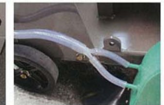
double water pipe for cooling both sides of blade