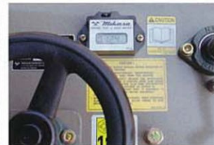
hour & tachometer (for MCD-218CEH)