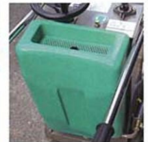
plastic water tank