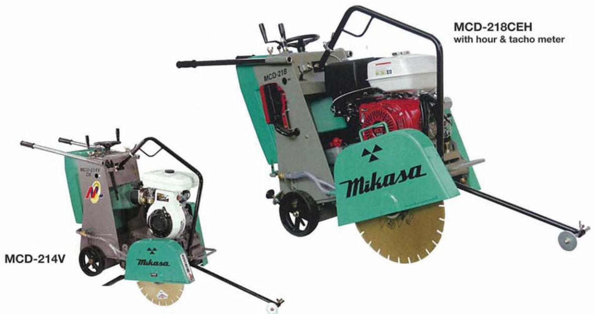
MCD-218CEH with hour & tachometer