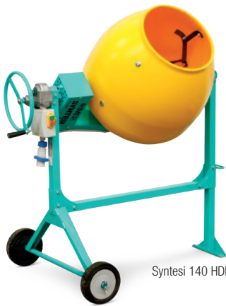
Syntesi 140 HDPE